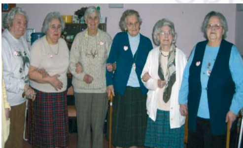
Clients at the Edna Dawes Lunch Club